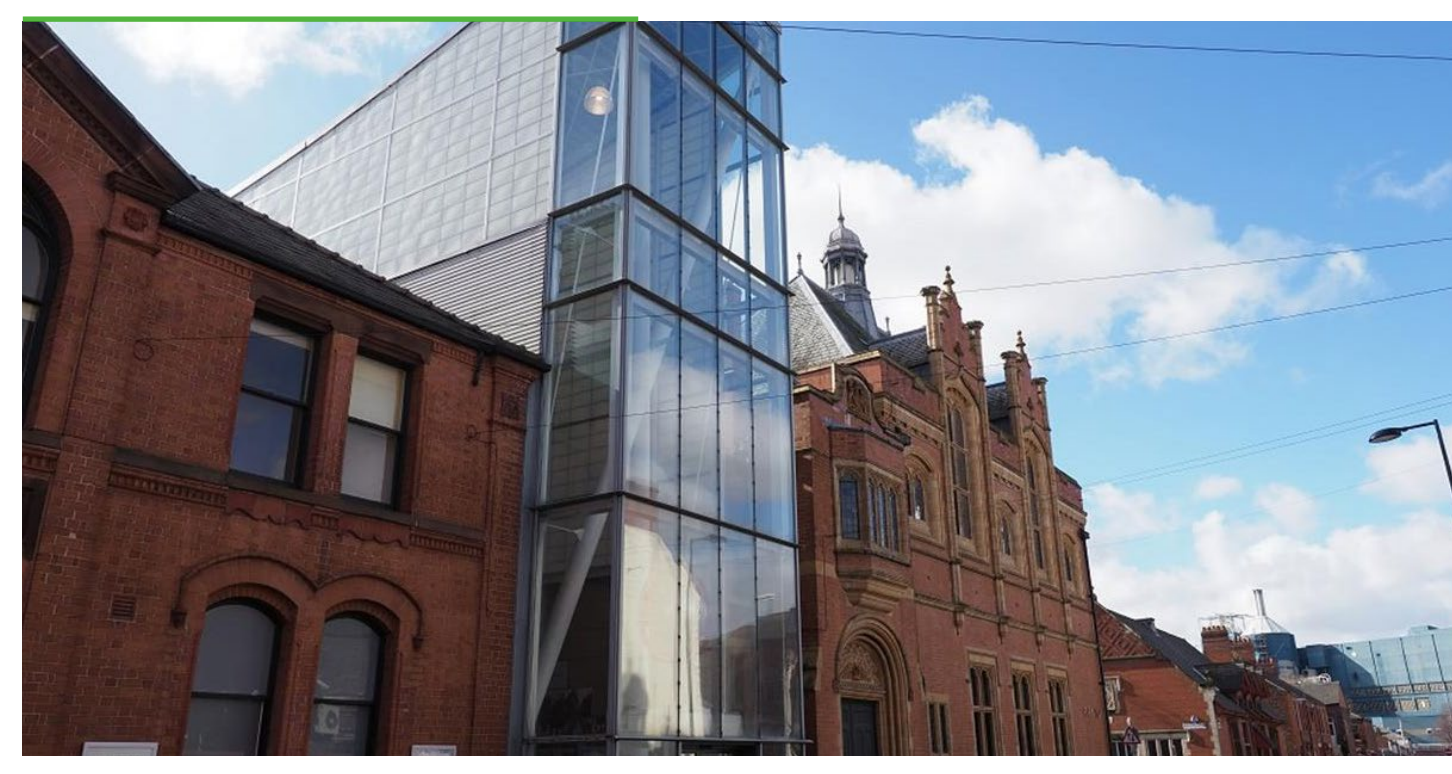
↑ The Pyramid Warrington, one of the areas to benefit from funding.