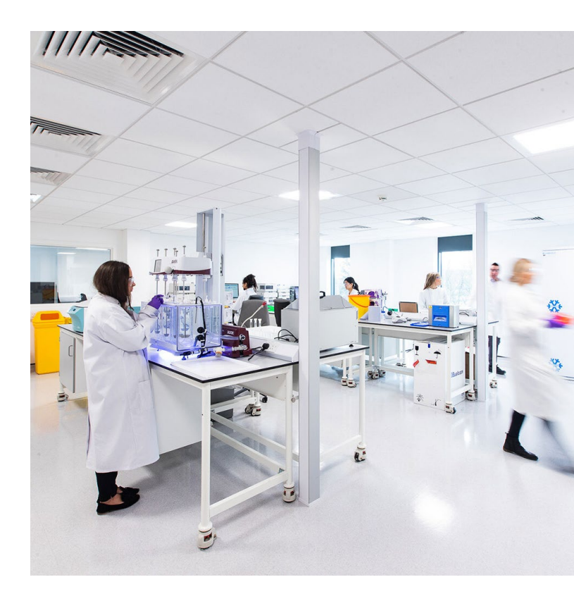
\uparrow A Lab at Aderley Park, the UK's largest single site life science campus.

It is crucial we build on the success that the Fund has achieved. There is high demand for life science funding, especially given the 80-90% drop in early-stage capital availability compared to 2019 as investors turn away from higher risk investments. We are therefore seeking funding to enable us to contribute £10m towards the establishment of a new £50m fund, alongside Bruntwood and GMCA on a parri-passu equal footing. This fund would cover the whole of Cheshire and Warrington and Greater Manchester and run for a 15-year period with a five-year investment period. In January 2021, the LEP Board approved, in principle an initial investment of £5m.