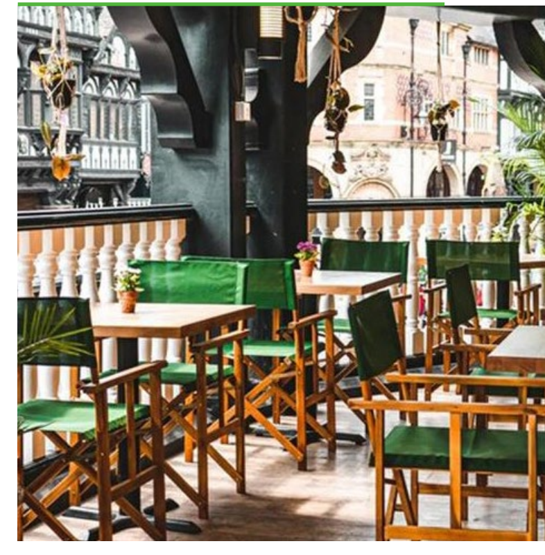
↑ Alfresco dining options made available in Chester City Centre.

We will ensure that we remain alert to any ongoing Covid challenges and be agile and ready to convene partners to respond as and when necessary. We will also advocate on behalf of businesses (including the third sector) with partners and government to help ensure that support gets to where it is needed.